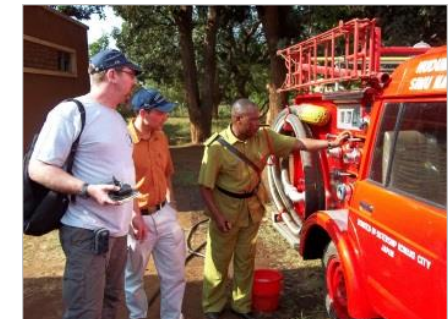
Equipment with fire-fighting materials