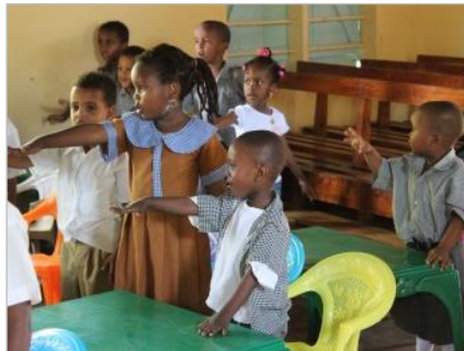
Sponsorships of 15 orphan and semi-orphan children