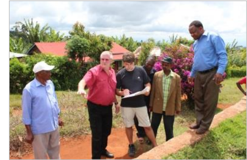
Construction of kitchen and dining hall, teachers' office. Enlargement of power supply and water supply.