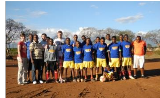
General support of street kids, sports equipment and financial support.