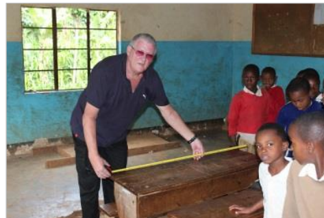
Classroom and computer equipment, teaching materials.