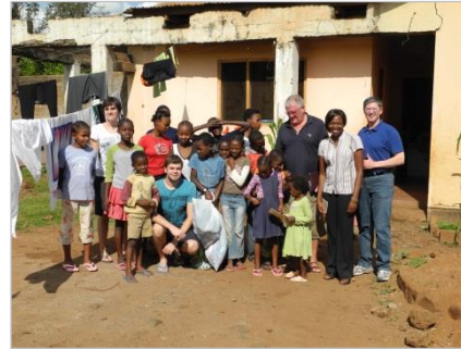
Support of 26 children; school fees, living expenses