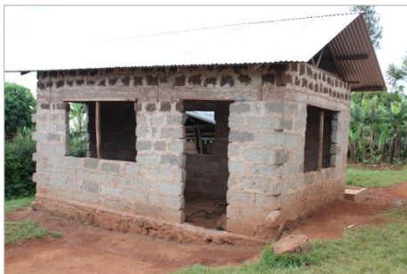
rough construction new kitchen

We want to support the school in the completion and equipping of the new kitchen.